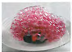
PHOTO GALLERY: A sensational slideshow of visually stunning dishes from acclaimed chefs.